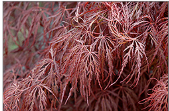
Crimson Queen Japanese Maple foliage

Crimson Queen Japanese Maple is recommended for the following landscape applications;