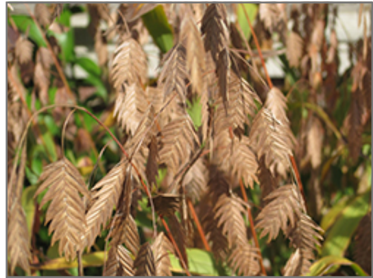
Northern Sea Oats fruit

Northern Sea Oats will grow to be about 4 feet tall at maturity, with a spread of 30 inches. Its foliage tends to remain dense right to the ground, not requiring facer plants in front. It grows at a medium rate, and under ideal conditions can be expected to live for approximately 10 years.