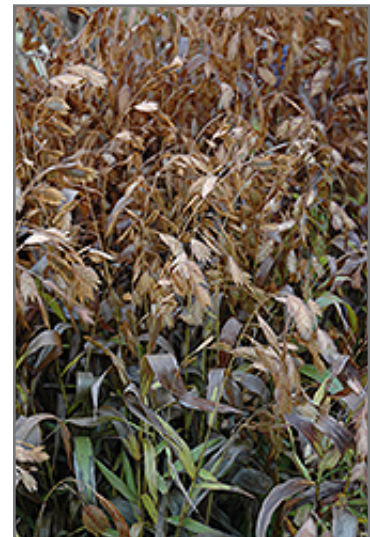
Northern Sea Oats in fall

This is a relatively low maintenance plant, and is best cleaned up in early spring before it resumes active growth for the season. It has no significant negative characteristics.