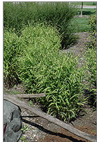
Northern Sea Oats