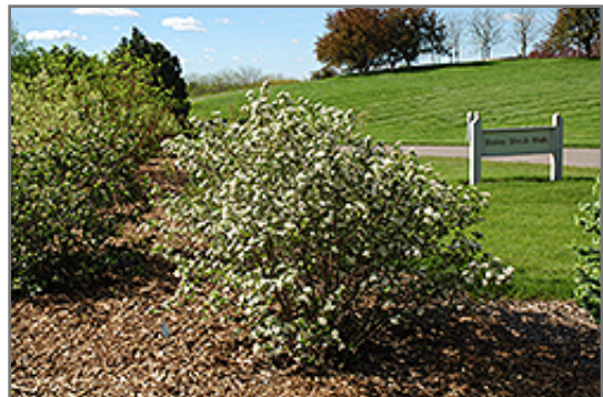
Autumn Magic Black Chokeberry in bloom