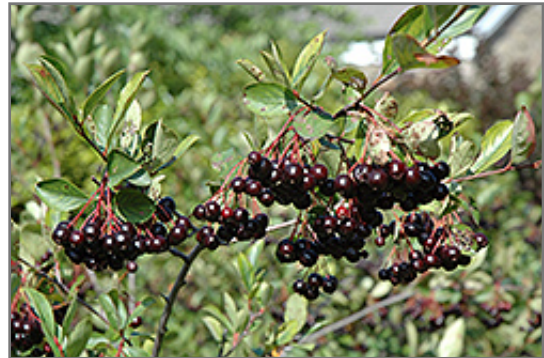
Autumn Magic Black Chokeberry fruit

Autumn Magic Black Chokeberry will grow to be about 4 feet tall at maturity, with a spread of 3 feet. It tends to be a little leggy, with a typical clearance of 1 foot from the ground. It grows at a slow rate, and under ideal conditions can be expected to live for approximately 20 years.