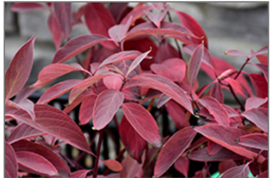
Arctic Fire Red Twig Dogwood in fall

This shrub does best in full sun to partial shade. It is an amazingly adaptable plant, tolerating both dry conditions and even some standing water. It is not particular as to soil type or pH. It is highly tolerant of urban pollution and will even thrive in inner city environments. This is a selection of a native North American species.