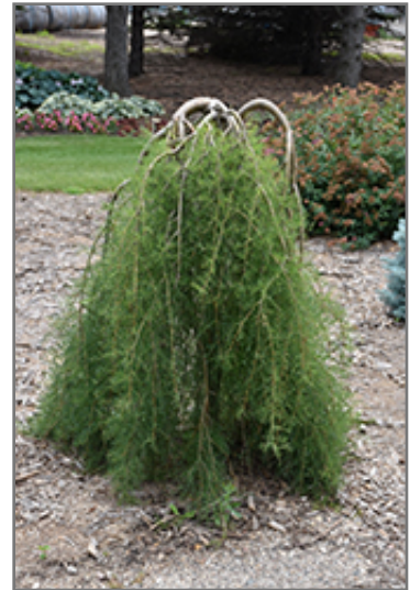
Walker Weeping Peashrub

This dwarf tree does best in full sun to partial shade. It prefers dry to average moisture levels with very well-drained soil, and will often die in standing water. It is considered to be drought-tolerant, and thus makes an ideal choice for xeriscaping or the moisture-conserving landscape. It is not particular as to soil type or pH, and is able to handle environmental salt. It is highly tolerant of urban pollution and will even thrive in inner city environments. This is a selected variety of a species not originally from North America.