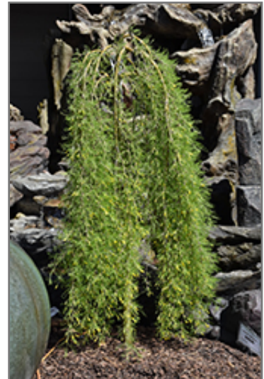
Walker Weeping Peashrub