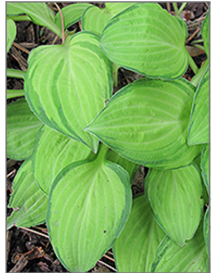
Emerald Tiara Hosta foliage