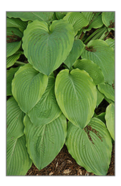
Key Lime Pie Hosta foliage

A wonderful variety featuring large mounds of medium green, lightly corrugated foliage with wide, golden yellow margins; pale lavender flowers appear in mid to late summer; adds color, contrast and texture to shaded beds and borders