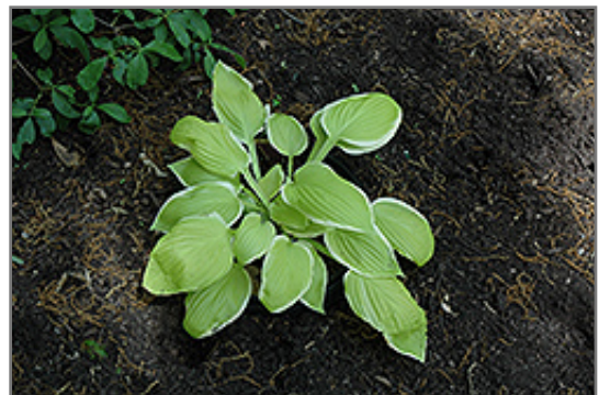
St. Elmo's Fire Hosta