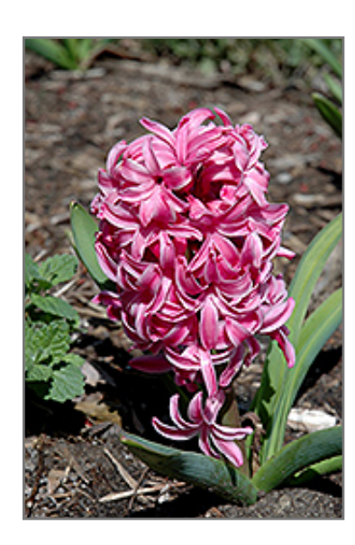
Pink Pearl Hyacinth flowers

Fragrant, vibrant pink flowers in spring cover this lovely perennial; plant among perennials and under leggy shrubs to get an early start on the growing season