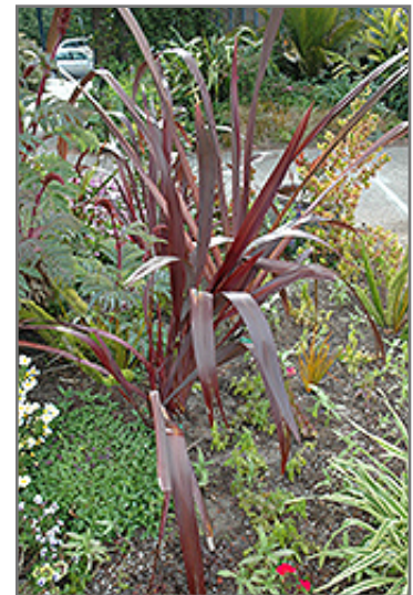
Amazing Red New Zealand Flax foliage